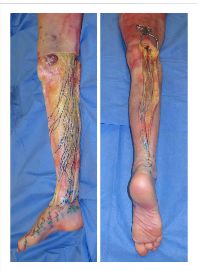
FIGURE 1 The lower extremity of a cadaver injected with dye into the superficial lymphatic vessels shows the medial pathway (left) and posterior pathway running along the small saphenous vein (right).

intervention is an area of intense study. Therefore, it is only to be expected that a tremendous effort has been placed on obtaining the biomolecular signatures of the human cardiovascular system (Leon-Mimila et al., 2019). Surprisingly, the characterization of human lymphatic vessels using novel techniques, such as spatial tissue profiling and single cell sequencing has started only recently. Much of our in-depth knowledge of cellular and biomolecular lymphatic vessel signatures to date comes from animal-derived studies (Kalucka et al., 2020). However, despite their genetic similarity to humans, mouse models are criticized for their failure to accurately mimic human disease phenotypes and their inaccurate portrayal of the human condition for a multitude of reasons including: i) less individual genetic variations, ii) inability to faithfully recapitulatecomplex nutrition- and lifestyle-associated changes in lymphatic structure and function, and iii) basic biomechanical properties such as being bipedal, i.e., the upright postural position of the human body can profoundly impact anatomy and function of the lymphatic system (Gashev and Zawieja, 2010).