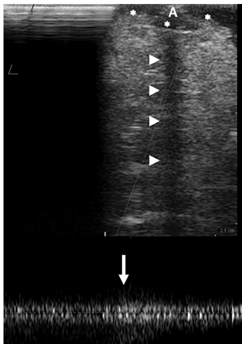
Fig. 2. Intraoperative US evaluation of the supercharged basilic vein following transplantation. The imaging depth is 2.1 cm. The vein (*) lies at the surface. Posterior shadowing (arrowheads) is caused by the coupler anastomosis (A). Venous patency is demonstrated using spectral Doppler (bottom). Low pressure flow in the basilic vein is demonstrated with augmentation (arrow) via gentle compression from the flap.

erative magnetic resonance angiography (MRA) illustrating the flap vasculature and lymph nodes is demonstrated in Figure 3. See Supplemental Digital Content 2 for our institutional postoperative therapy regimen. (See figure, Supplemental Digital Content 2, which displays postoperative therapy regimen for patients undergoing VLNT, http://links.lww.com/PRSGO/B223 .)